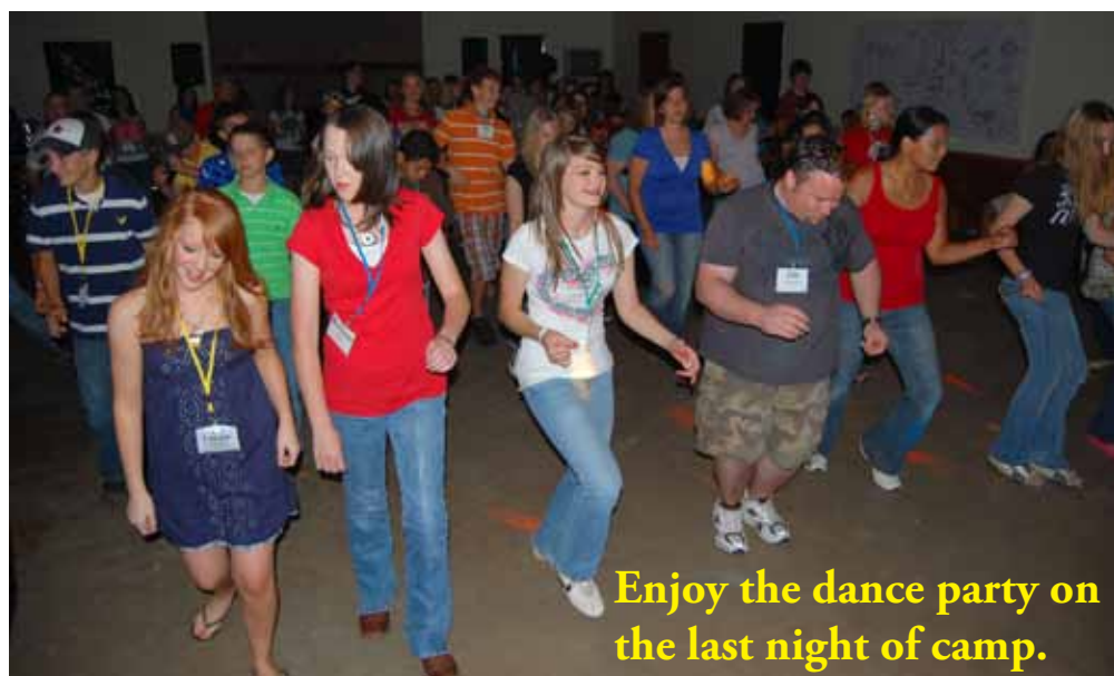
Enjoy the dance party on the last night of camp.