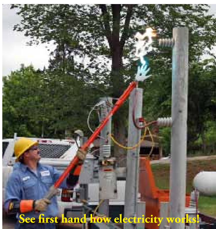
See first hand how electricity works!

For more information & to request an application: