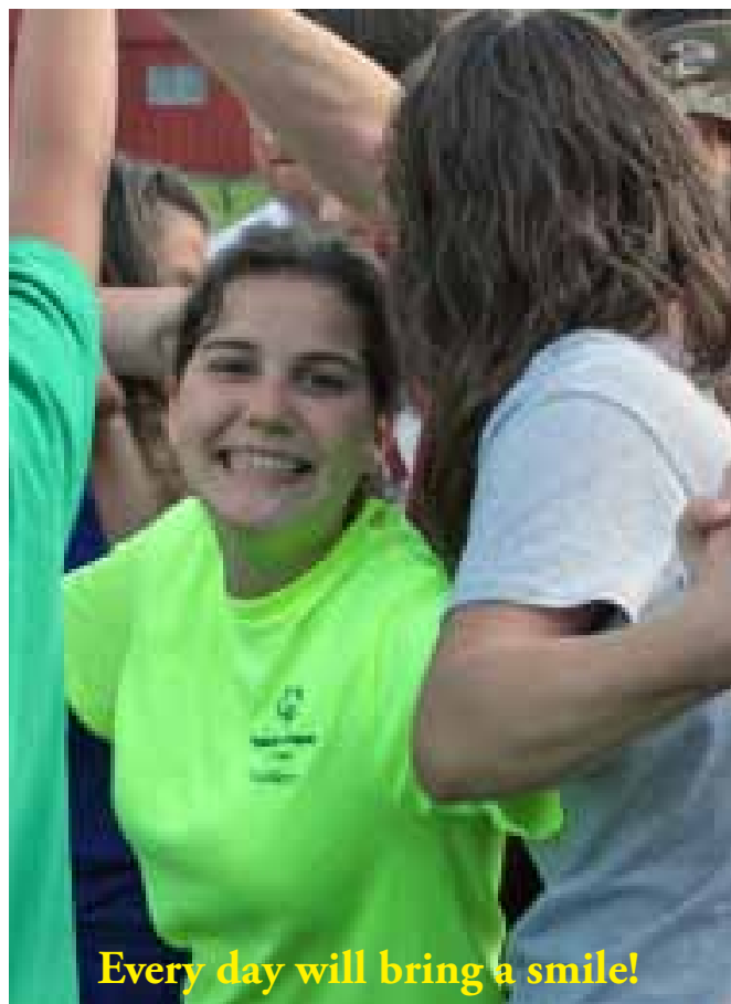
Every day will bring a smile!