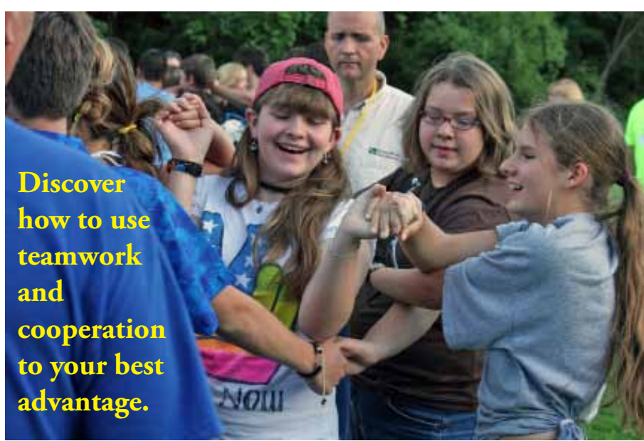
Discover how to use teamwork and cooperation to your best advantage.